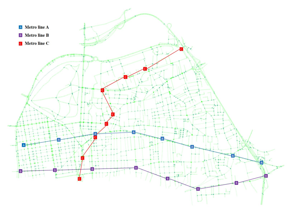
FIG. 1 – Traffic network of Lyon 6e + Villeurbanne with three metro lines

In this work, we use Symuvia as a trip-based simulator for calculating the needed variables in the network. Symuvia has been developed by the LICIT laboratory in IFSTTAR. It is a microscopic simulator based on the Lagrangian resolution of the LWR model (Leclercq et al. (2007)). The day-to-day DTA is applied to the large-scale network of Lyon 6e + Villeurbanne with 1,883 Nodes, 3,383 Links, 94 Origins, 227 Destinations and 54,190 trips. Walking, buses and private cars are the initial available transportation modes in the network. There are three metro lines (A, B and C) and 25 metro stations in the network (figure 1).