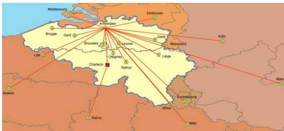
Figure 1 - Solution considering operational costs: single terminal location at Charleroi

transport starts to become competitive when the costs of rail transport and/or transshipment decrease, by being subsidized by the government (Figure 2). Like this, the intermodal freight transport can become very competitive, even for short distances inside Belgium. It is also shown that the demand flows from the border regions of the neighboring countries of Belgium are all served by the intermodal service. This offers some insight that, despite of the small area of the country, due to its location, Belgium is a promising candidate to promoting intermodal transport in the European perspective.